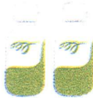
Two bottles of CLENPIQ (5.4 oz each)